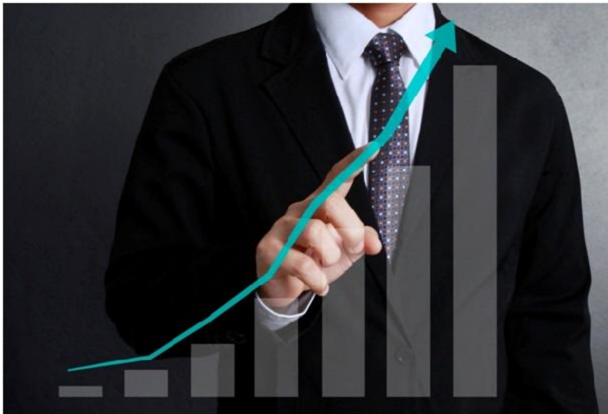
Fig 1.3 ISO 9004 Guidance to Achieve Sustained Success

At the outset, implementing the transition to ISO 9001 is a big deal, but with such benefits in mind it's hard to disagree with its effectiveness.