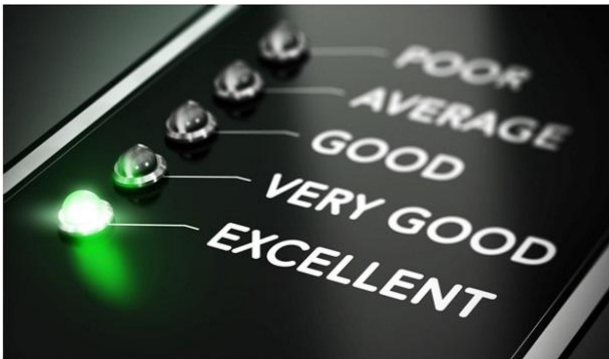
Fig 1.2 Continual Improvements

With such a strong emphasis placed upon improvement and a structure to constantly move forward it is impossible not to maintain the best quality for your products and services. ISO 9001 keeps your leadership on task to keep things fresh and maintain this quality no matter what.